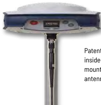
Patented inside-the-rod mounted UHF antenna design