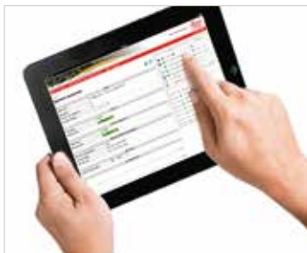
MODULAR REFWORX SOFTWARE