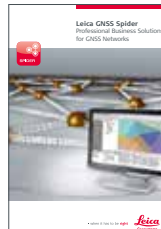
Leica GNSS Spider Leica SpiderWeb Leica SpiderQC

Illustrations, descriptions and technical data are not binding. All rights reserved. Printed in Switzerland – Copyright Leica Geosystems AG, Heerbrugg, Switzerland, 2016. 846243en – 03.16