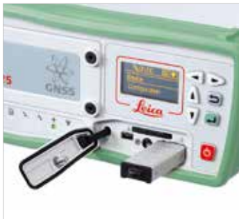
SMART DATA STORAGE