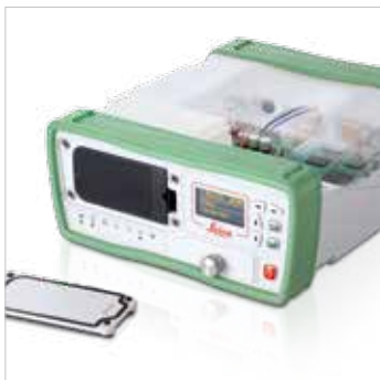
SMART POWER SOLUTIONS