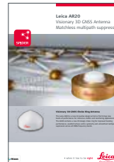
Leica AR20 Leica AR25 Leica AR10