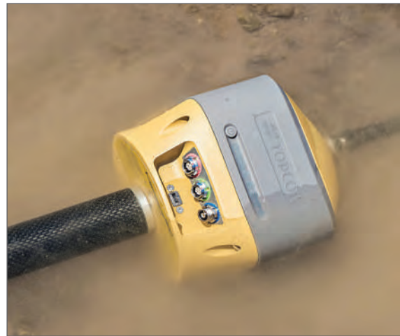
IP67 Waterproof Rating

Awkward shots on steep slopes or hard to reach spots are now a breeze with TILT™.