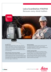
Leica ScanStation P30/40

Illustrations, descriptions and technical specifications are not binding. All rights reserved. Printed in Switzerland – Copyright Leica Geosystems AG, Heerbrugg, Switzerland 2016. 835466en - 03.17