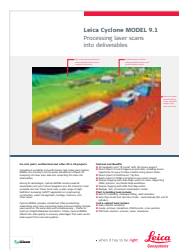
Leica Cyclone MODEL

Leica Geosystems AG leica-geosystems.com